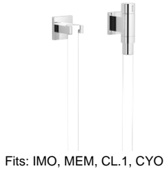
Fits: IMO, MEM, CL.1, CYO