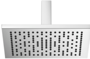
Fits: MEM, CL.1